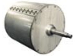
The perforated tilting ribs of the cylinder provide a dynamic rinsing effect.