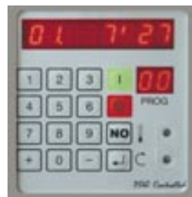
PS 40 microprocessor directly accessible through the keypad.