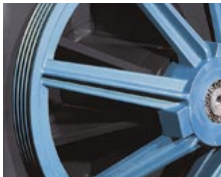
JENSEN's heavy-duty cast iron pulley and housing.

Equipped with oversized industrial bearing houses made of one single piece of cast iron and housing full industrial technical bearings. The multiple seal design of JENSEN's industrial bearing houses prevents any premature leakage and enhances bearing life.