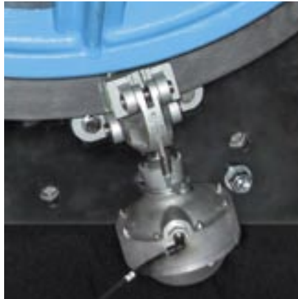
Powerful, versatile single motor drive system with high-efficiency disk brake.