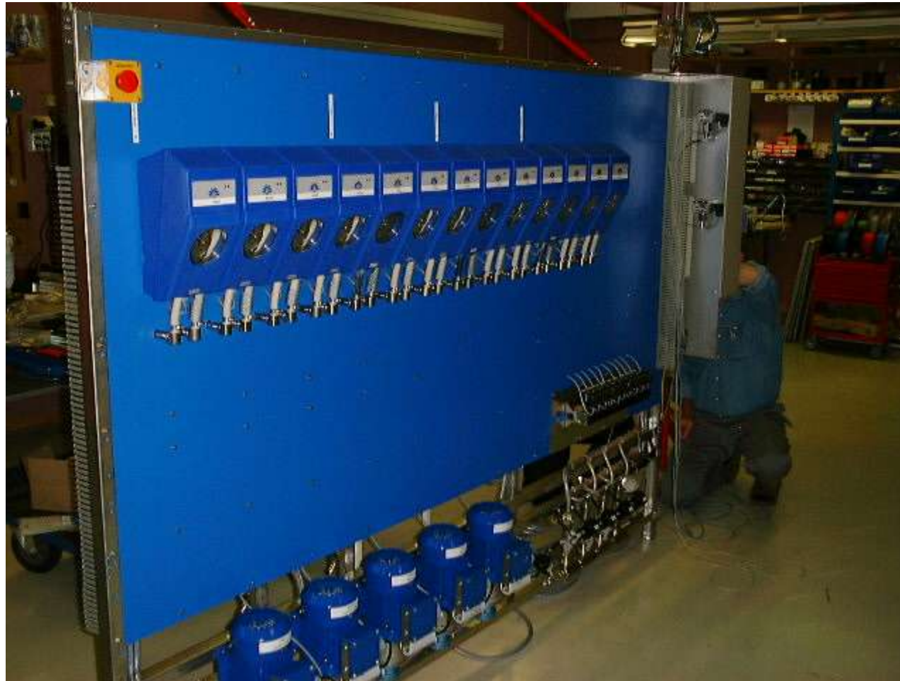
Liquid Dosing System with Management Information System