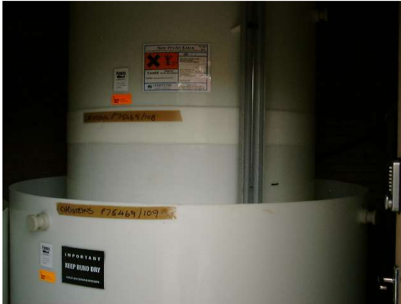
Bunded bulk liquid storage tank