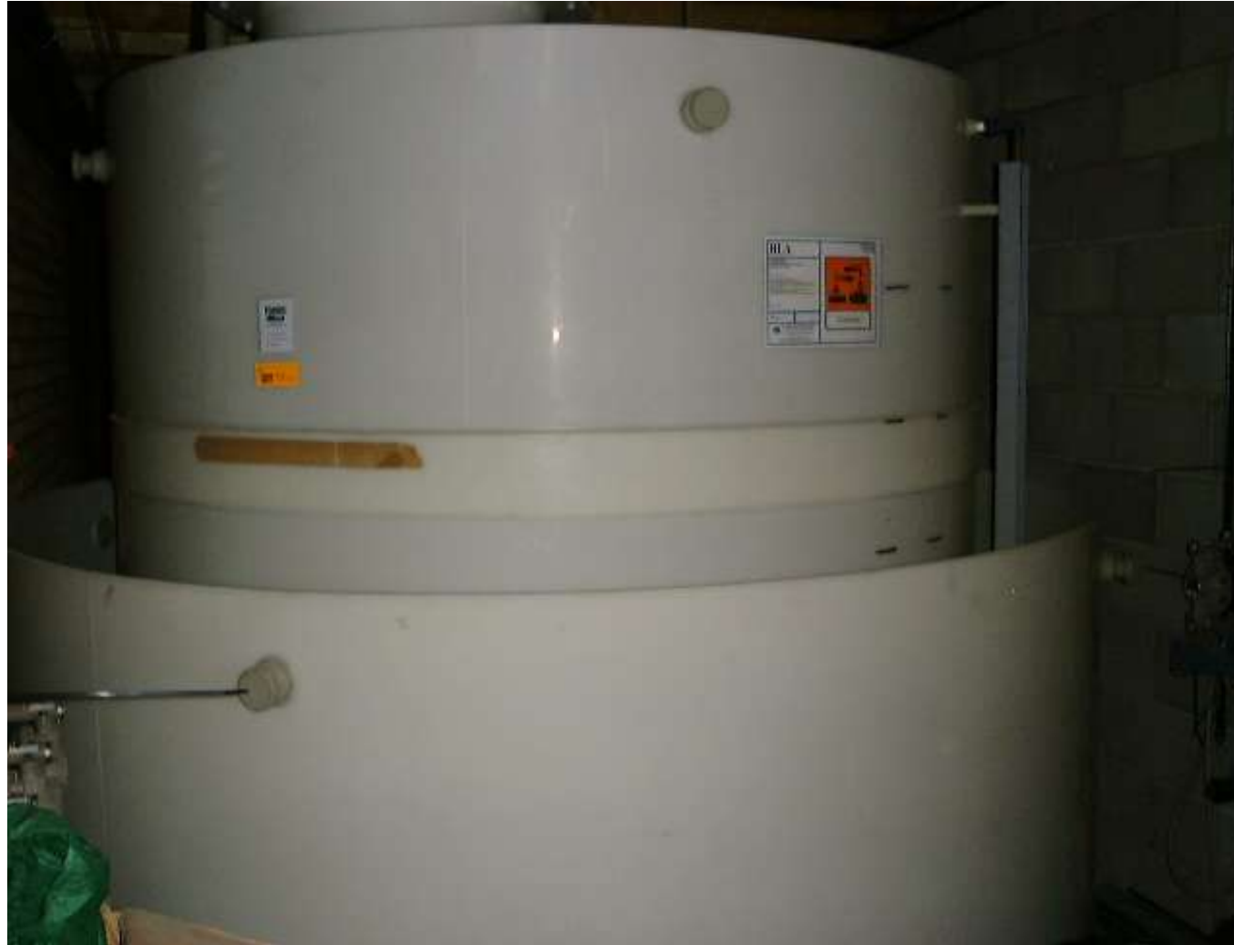
Bunded bulk liquid storage tank