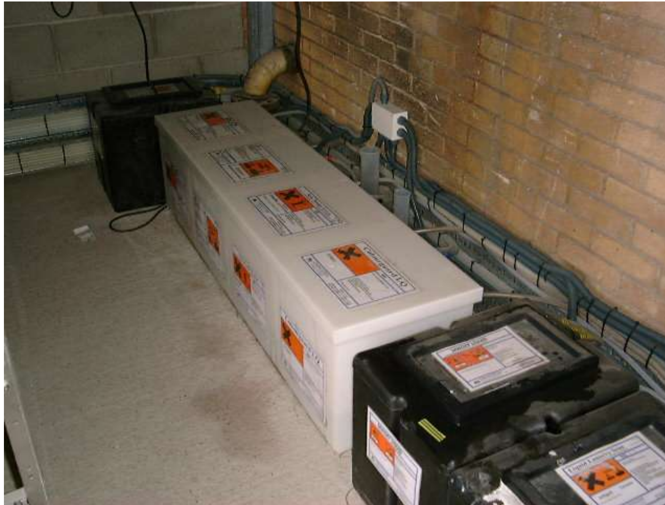
Intermediate liquid storage tanks – for multi machine dosing