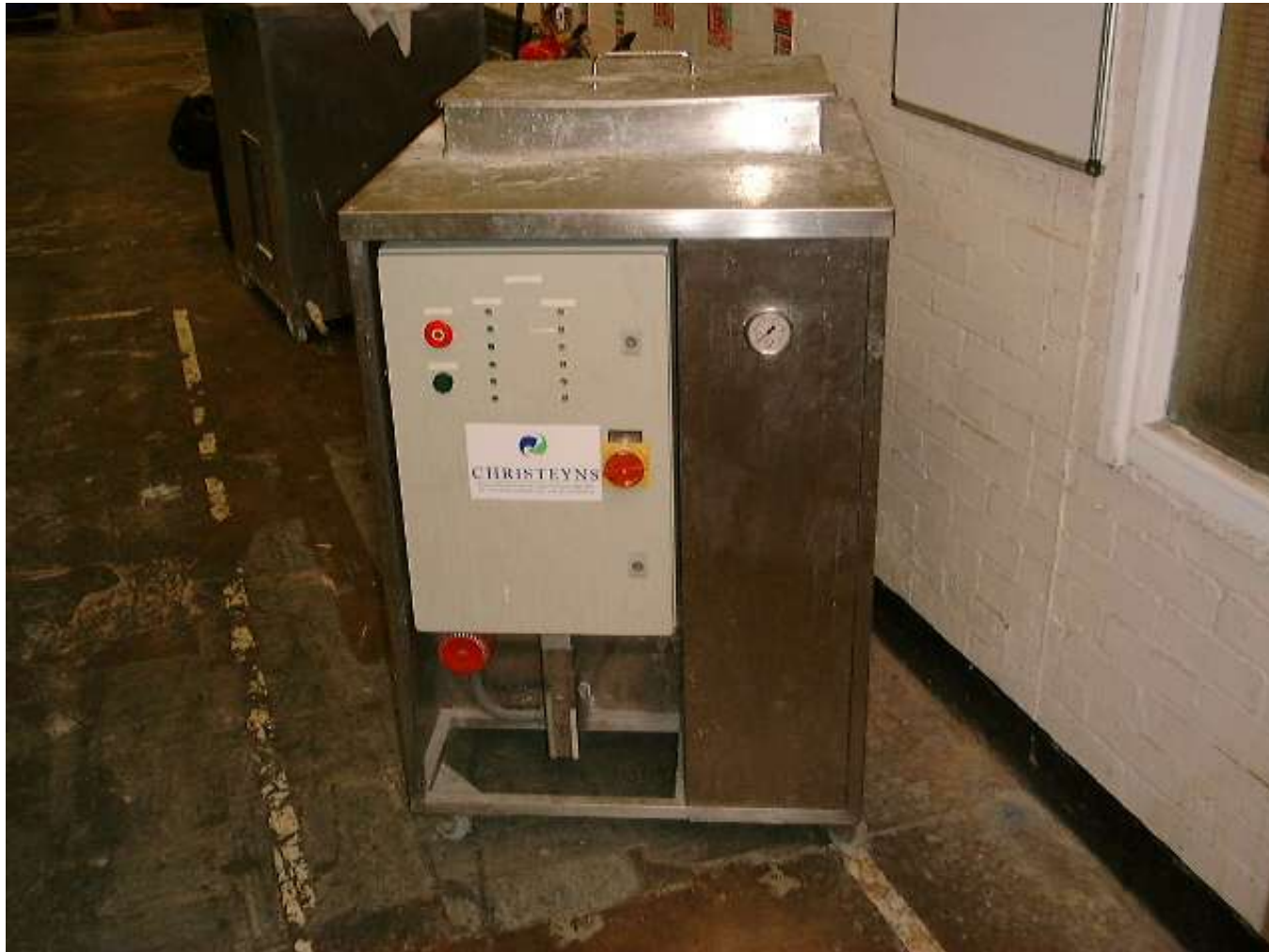
Powder automatic dosing unit