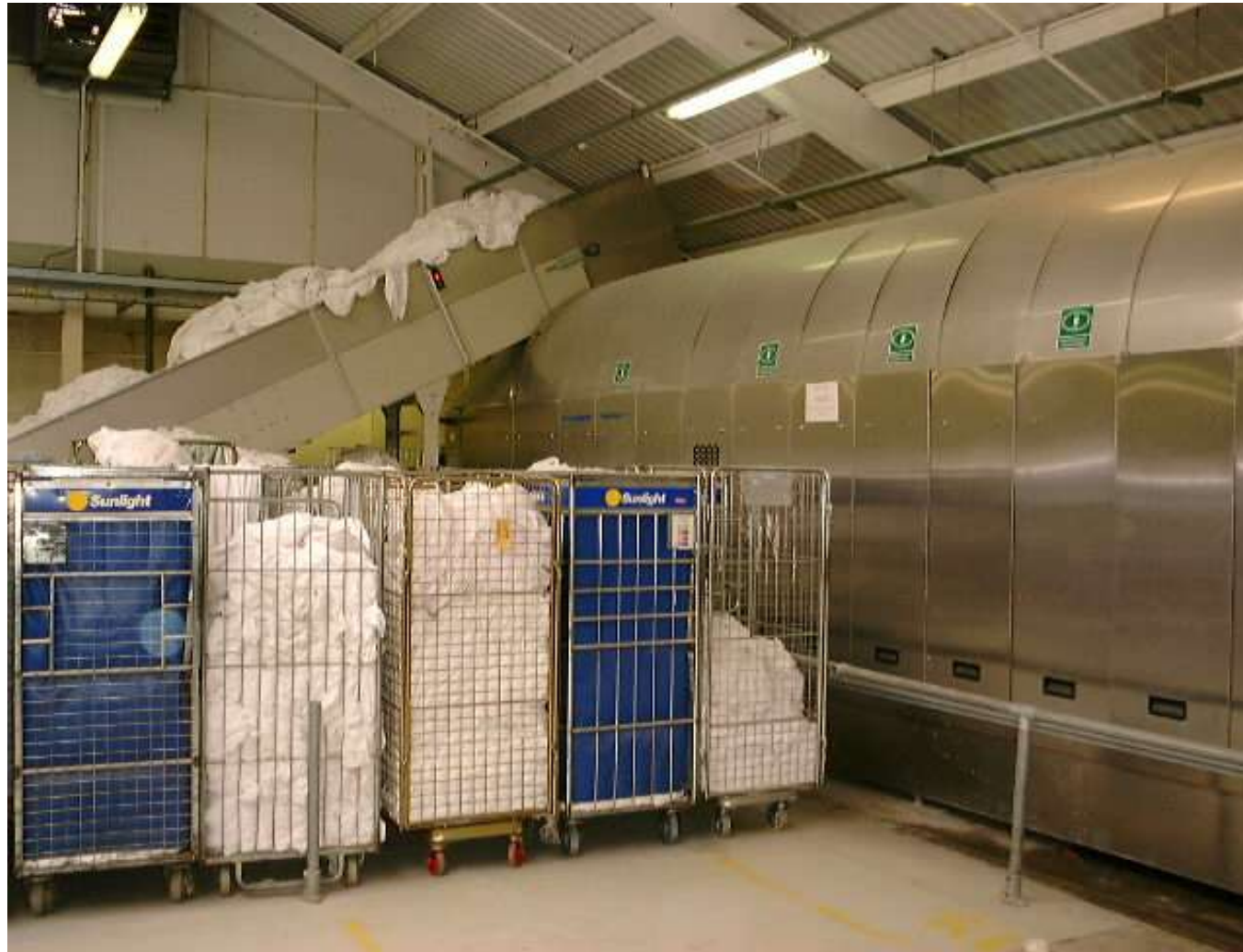
Continuous Batch Washer - Loading