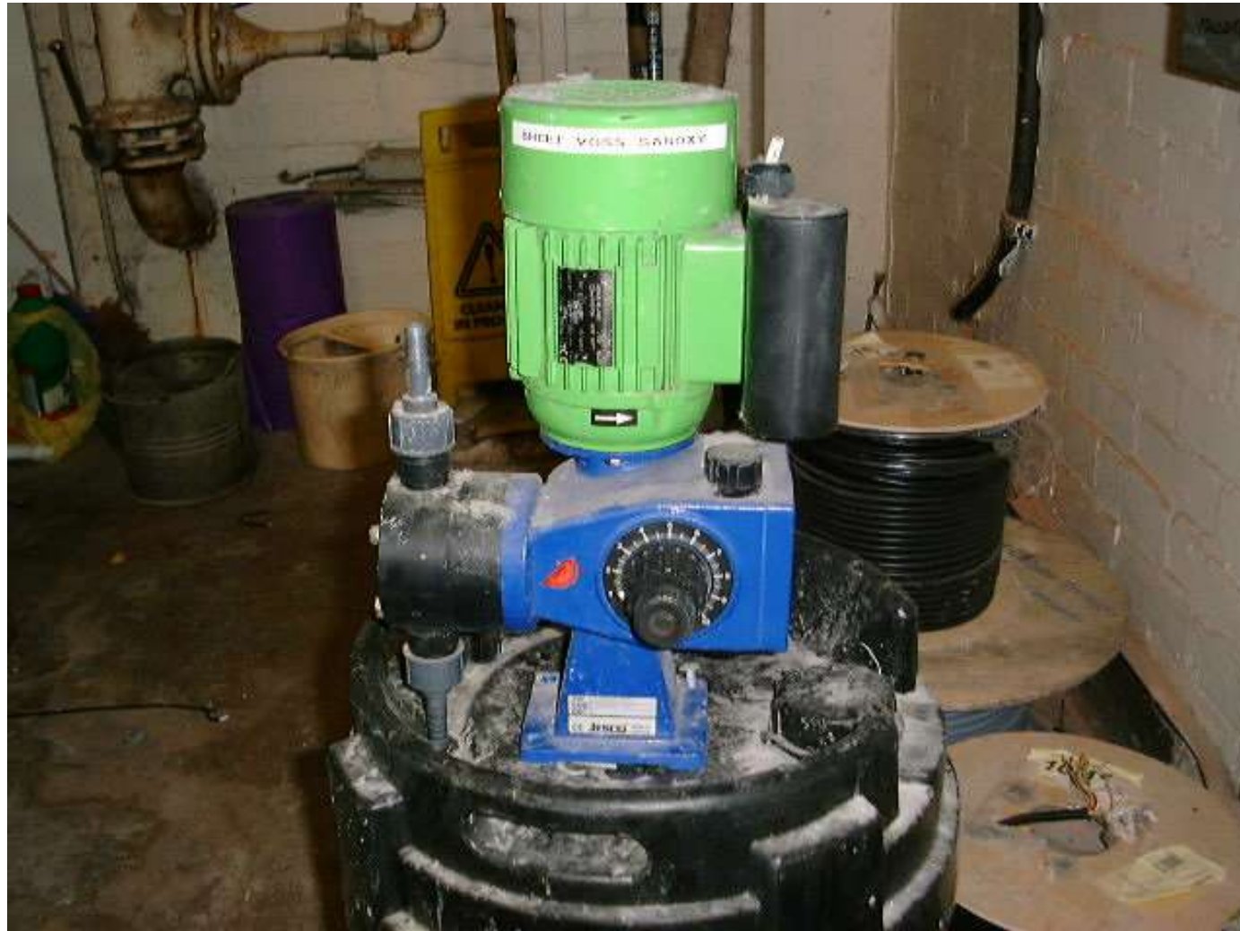
Volumetric/ Piston Pump