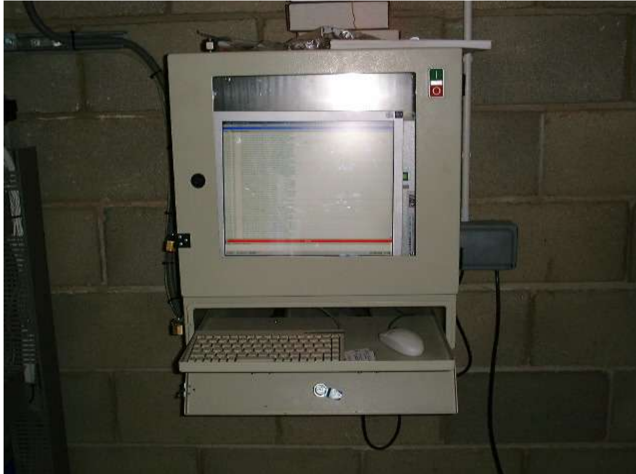
MIS operator information screen