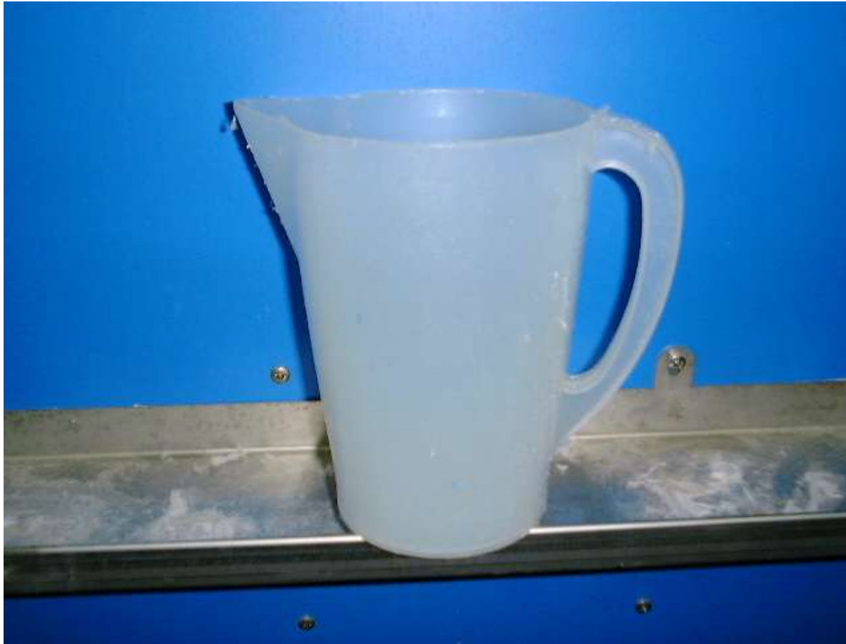
The Original Dosing Kit