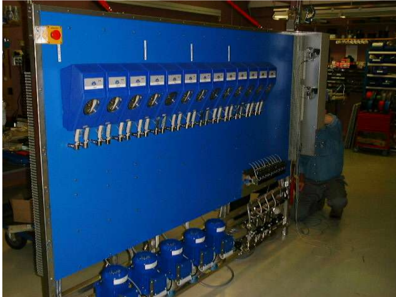
Bank of Peristaltic Pumps for automatic liquid dosing linked to MIS