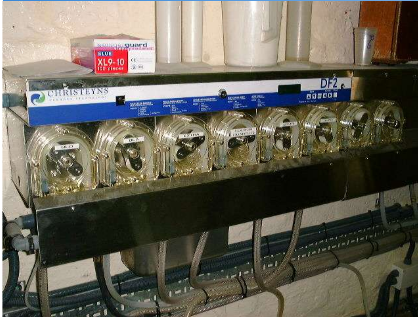
Liquid automatic dosing system – peristaltic pumps