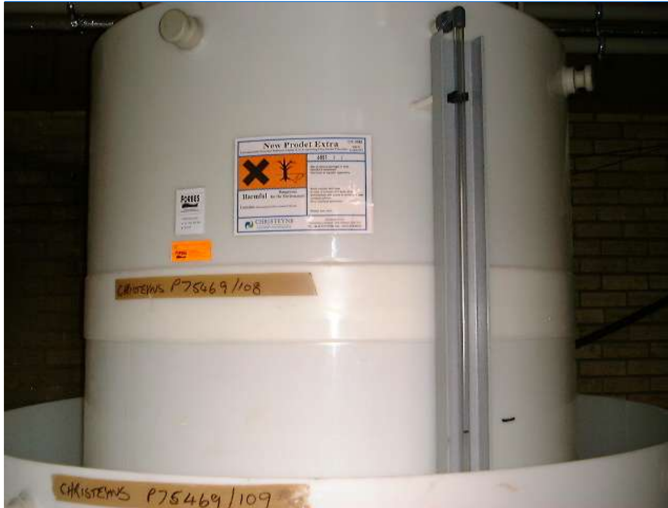
Bunded bulk liquid storage tank