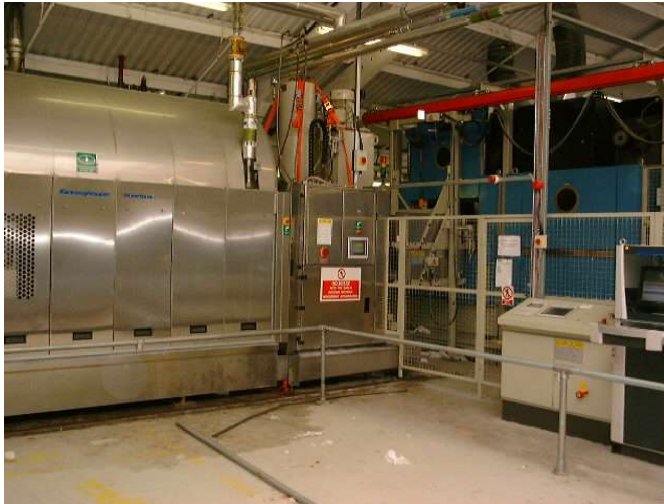
Continuous Batch Washer – Side View