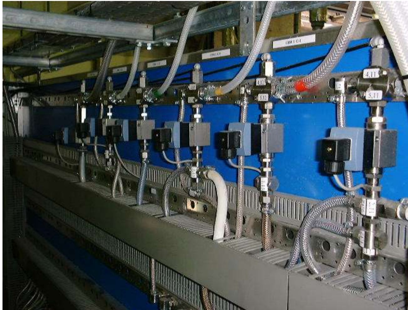
MIS controlled dosing system