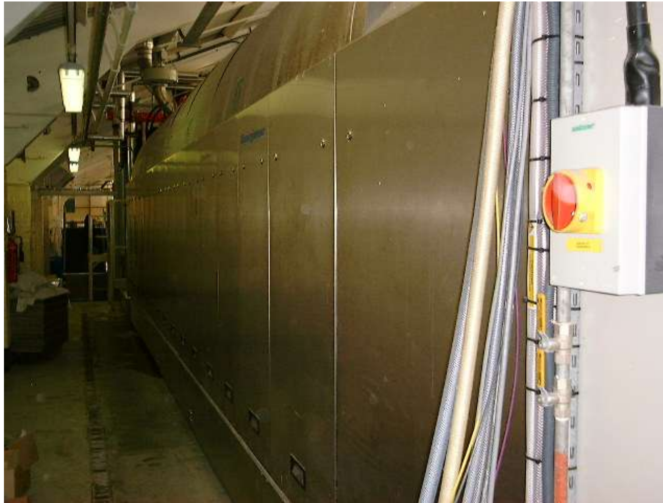
Continuous Batch Washer – Side View