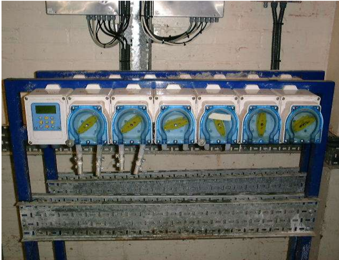
Liquid automatic dosing system – peristaltic pumps